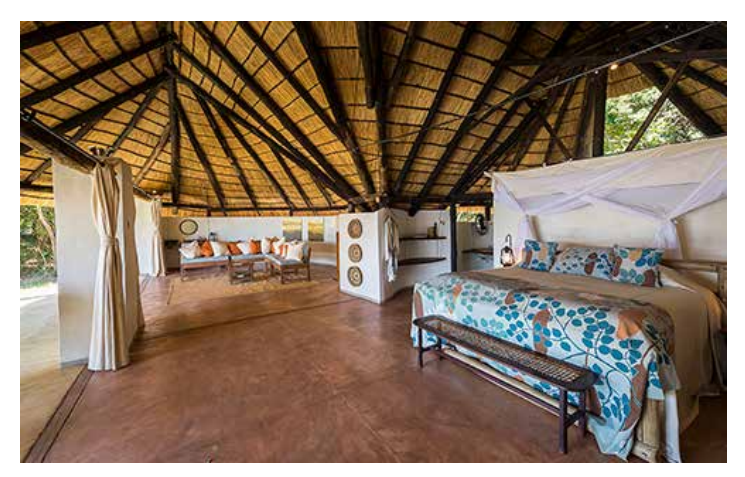
NKWALI CAMP Luangwa Valley, Zambia Day 1 (1 night)

Beautifully set in an ebony grove overlooking South Luangwa National Park, Nkwali features six bamboo chalets, each with an attached private bathroom partly open to the sky (for the delightful experience of showering under the sun or in the moonlight!). The bar, on the banks of the snaking Luangwa River, is built around a massive ebony tree and is a fantastic place for watching the sunset across the river, and the camp's swimming pool is a great place to cool off after a day of gameviewing. There's a small lagoon in view from the dining room where elephants, bushbucks, and other wildlife can be seen, and hippos are almost always around this charming camp. The atmosphere at Nkwali is relaxed and friendly, the food is excellent, and the staff is top notch.