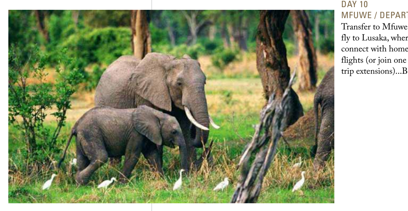
MFUWE / DEPART Transfer to Mfuwe and fly to Lusaka, where we connect with homeward flights (or join one of our

On the morning of Day 7, we end our mobile walking safari and transfer to Nsefu Camp, a beautiful lodge set on a sweeping bend of the Luangwa River in the remote Nsefu sector of South Luangwa National Park. Nsefu is the local name for eland, and this part of the park has always been a stronghold for eland. Nsefu camp is actually named after a senior local chief who is named after this area; he created one of the first community reserves, Nsefu sector, in partnership with the parks service in the early '50s. From Nsefu, we take bush walks as well as morning and evening drives by open 4WD vehicle. Night drives, in particular, are always fascinating. During the day we may see lions resting indolently, but at night, the "hunt is on" and we may see them actively prowling for prey. Our schedule is flexible, with meal times based around the all-important game drives...BLD each day