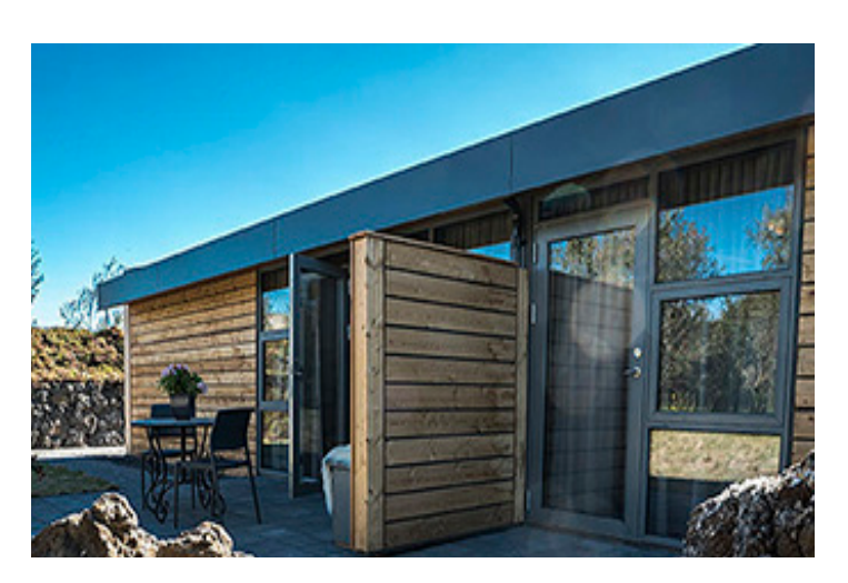
HOTEL HÚSAFELL Stórarjódur, Iceland

Halfway between Reykjavík and Vík along the south coast, the Hotel Rangá has a wonderfully isolated setting. The Rangá offers spacious, well-appointed rooms, and a good restaurant that serves some of the freshest fish imaginable. The hot tubs have amazing views.