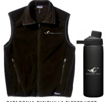
PATAGONIA SYNCHILLA FLEECE VEST PLUS INSULATED CAMELBAK WATER BOTTLE