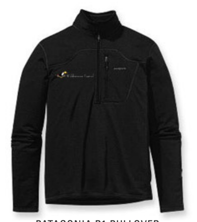
PATAGONIA R1 PULLOVER