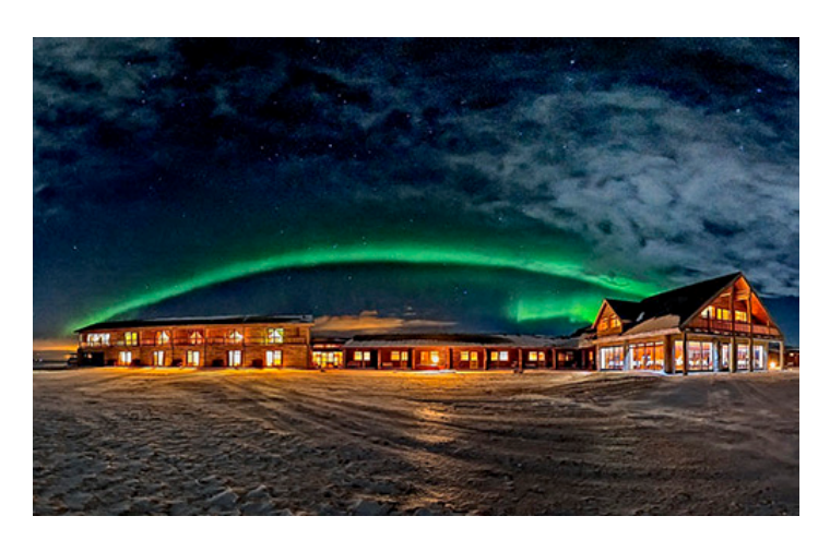
HOTEL RANGÁ Hella, Iceland Days 1 to 2 (2 nights)

Halfway between Reykjavík and Vík along the south coast, the Hotel Rangá has a wonderfully isolated setting. The Rangá offers spacious, well-appointed rooms, and a good restaurant that serves some of the freshest fish imaginable. The hot tubs have amazing views.