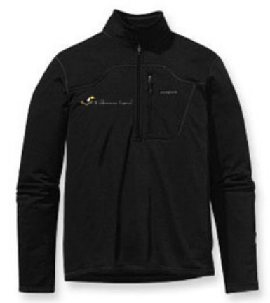
PATAGONIA R1 PULLOVER