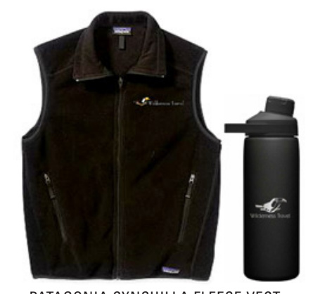
PATAGONIA SYNCHILLA FLEECE VEST PLUS INSULATED CAMELBAK WATER BOTTLE