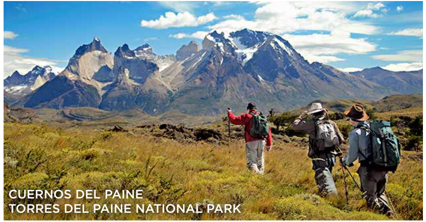
CUERNOS DEL PAINE TORRES DEL PAINE NATIONAL PARK