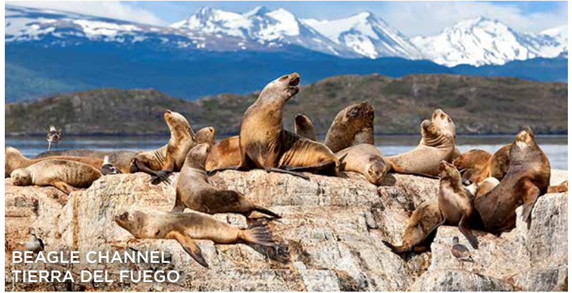
BEAGLE CHANNEL TIERRA DEL FUEGO