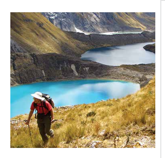
"A spectacular and fun trip!" Trish K., Berkeley, CA