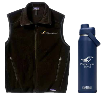
PATAGONIA SYNCHILLA FLEECE VEST; INSULATED CAMELBAK WATER BOTTLE

Toucan Club travel discounts cannot be used in conjunction with any other discount, unless otherwise specified. Discounts are deducted from the base trip cost and shown on the final invoice. The base trip cost is the main land/tier cost and does not include single supplement fees, extensions, internal airfare, or other additional charges. Bonus gifts (T-shirts, luggage tags, vests, water bottles, and pullovers) will be mailed approximately three weeks prior to trip departure. Terms and conditions of Toucan Club bonuses are subject to change or cancellation at the discretion of Wilderness Travel, Inc.