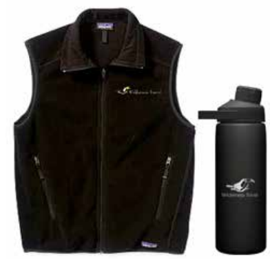
PATAGONIA SYNCHILLA FLEECE VEST + KLEEN KANTEEN 270Z WATER BOTTLE