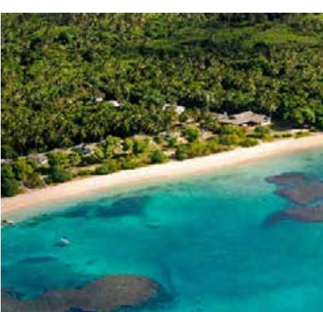
OUR BEACH RESORT