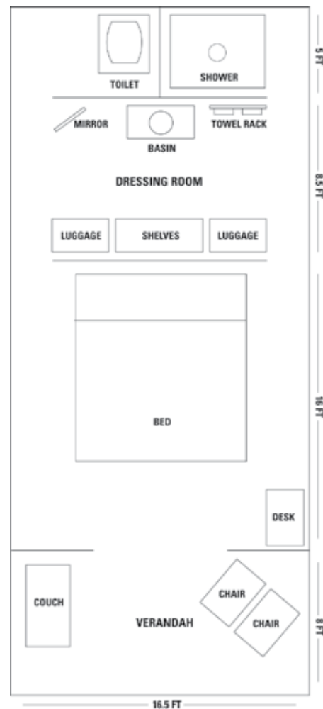
TENT LAYOUT ABOVE IS FOR TARANGIRE; SERENGETI TENTS MEASURE 30' X 14.5'