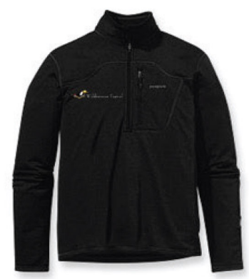
PATAGONIA R1 PULLOVER

We are very proud to have one of the highest rates of repeat travelers in the business, and have established the Wilderness Travel Toucan Club to reward you for your loyalty. For more information, please visit the Toucan Club page of our website at <a href="https://www.wildernesstravel.com/toucan">www.wildernesstravel.com/toucan</a>.