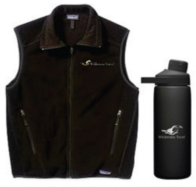
PATAGONIA SYNCHILLA FLEECE VEST + KLEEN KANTEEN 27OZ WATER BOTTLE