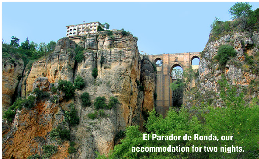
El Parador de Ronda, our accommodation for two nights.