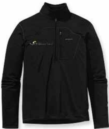
PATAGONIA R1 PULLOVER

We are very proud to have one of the highest rates of repeat travelers in the business, and have established the Wilderness Travel Toucan Club to reward you for your loyalty. For more information, please visit the Toucan Club page of our website at www.wildernesstravel.com/toucan .