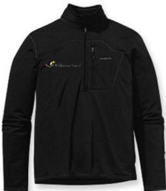
PATAGONIA R1 PULLOVER

We are very proud to have one of the highest rates of repeat travelers in the business, and have established the Wilderness Travel Toucan Club to reward you for your loyalty. For more information, please visit the Toucan Club page of our website at wildtrav.com/resources/toucan-club .