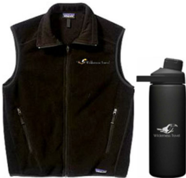
PATAGONIA SYNCHILLA FLEECE VEST + KLEEN KANTEEN 27OZ WATER BOTTLE