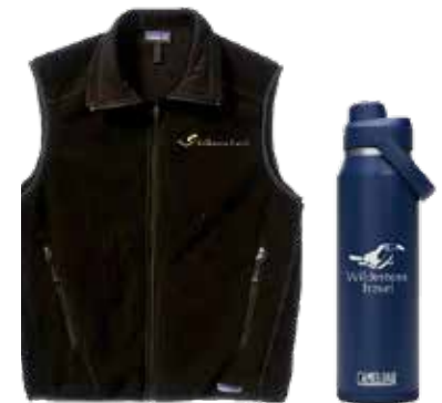
PATAGONIA SYNCHILLA FLEECE VEST; INSULATED CAMELBAK WATER BOTTLE