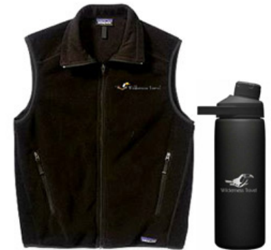
PATAGONIA SYNCHILLA FLEECE VEST + KLEEN KANTEEN 27OZ WATER BOTTLE