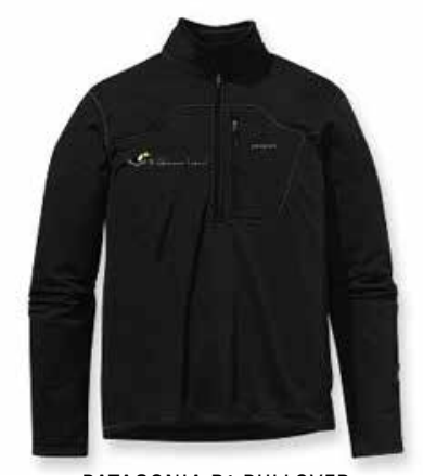
PATAGONIA R1 PULLOVER