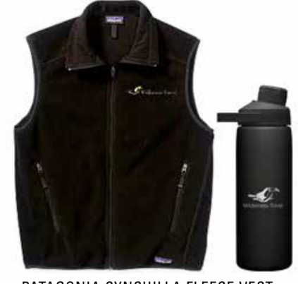
PATAGONIA SYNCHILLA FLEECE VEST PLUS INSULATED CAMELBAK WATER BOTTLE