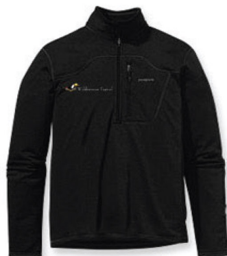
PATAGONIA R1 PULLOVER

We are very proud to have one of the highest rates of repeat travelers in the business, and have established the Wilderness Travel Toucan Club to reward you for your loyalty. For more information, please visit the Toucan Club page of our website at www.wildernesstravel.com/toucan .