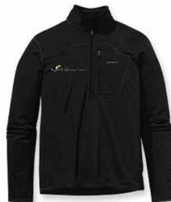
PATAGONIA R1 PULLOVER