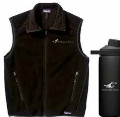
PATAGONIA SYNCHILLA FLEECE VEST PLUS INSULATED CAMELBAK WATER BOTTLE