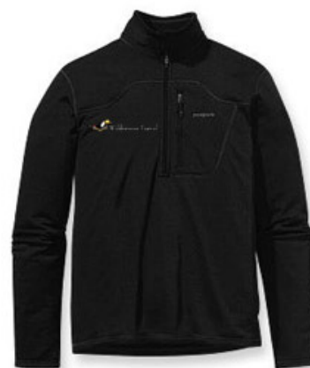
PATAGONIA R1 PULLOVER