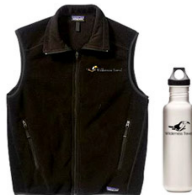
PATAGONIA SYNCHILLA FLEECE VEST PLUS KLEAN KANTEEN 270Z WATER BOTTLE