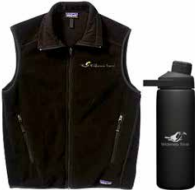
PATAGONIA SYNCHILLA FLEECE VEST PLUS KLEAN KANTEEN 270Z WATER BOTTLE