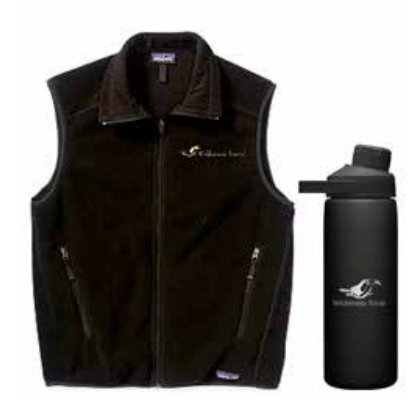
PATAGONIA SYNCHILLA FLEECE VEST + KLEEN KANTEEN 27OZ WATER BOTTLE