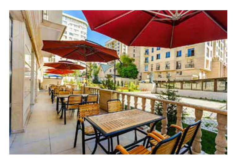
SOLUTEL HOTEL Bishkek, Kyrgyzstan Day 13 (1 night)

A five-minute walk from Ala-Too, Bishkek's central square, the Solutel Hotel is a comfortable base for exploring the city. Guest rooms feature orthopedic mattress options, a tea table, a pillow menu, and private bathrooms with slippers and bathrobes. You can enjoy breakfast on the pleasant outdoor terrace overlooking a quiet courtyard or in the sunlit dining room. If you want to decompress after a long flight or a day in the city, head to the sauna and fitness room, or indulge in a massage treatment at the spa.