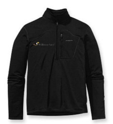
PATAGONIA R1 PULLOVER

We are very proud to have one of the highest rates of repeat travelers in the business, and have established the Wilderness Travel Toucan Club to reward you for your loyalty. For more information, please visit the Toucan Club page of our website at www.wildernesstravel.com/toucan.