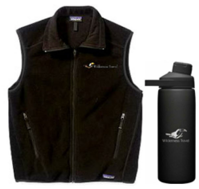
PATAGONIA SYNCHILLA FLEECE VEST + KLEEN KANTEEN 27OZ WATER BOTTLE