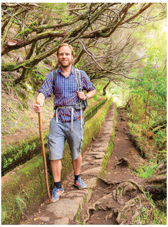
Overnight: Casa Velha do Palheiro Meals: B, L, D Hiking Details: 4-5 hours, 7 miles, 900 feet descent, moderate