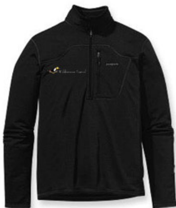
PATAGONIA R1 PULLOVER

We are very proud to have one of the highest rates of repeat travelers in the business, and have established the Wilderness Travel Toucan Club to reward you for your loyalty. For more information, please visit the Toucan Club page of our website at www.wildernesstravel.com/toucan .