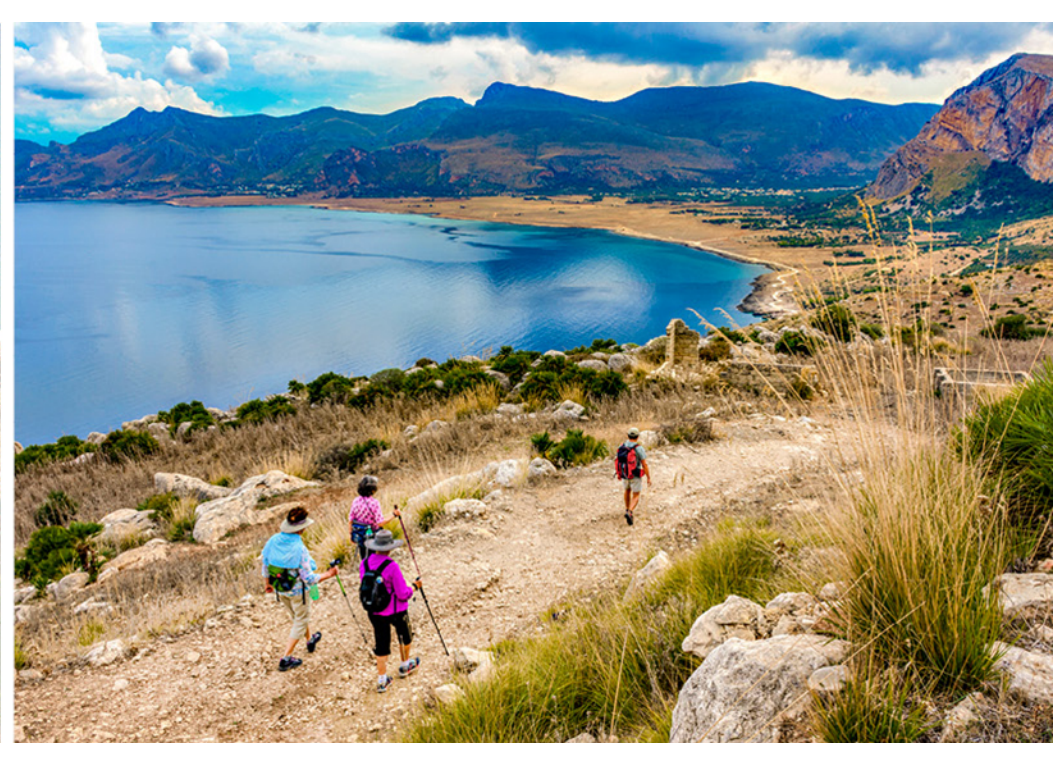
Overnight: Hotel Elimo Meals: B, L

Hiking Details: 4.5 miles, 2.5 hours, 200'