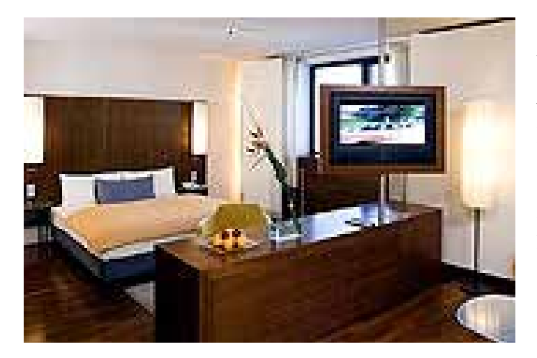
PENZ HOTEL Innsbruck, Austria, Days 10 to 11 (2 nights)

Set right beneath the castle in the heart of Vaduz, this charming 29-room hotel offers all the amenities, including Wi-Fi. Guestrooms are spacious, some with views of the mountains, and there are gym facilities if you still need a workout after your daily hike! The staff couldn't be more kind and friendly.