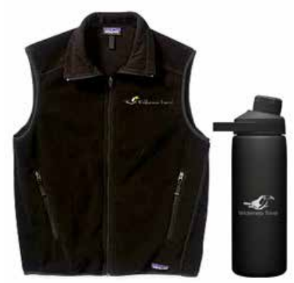
PATAGONIA SYNCHILLA FLEECE VEST PLUS INSULATED CAMELBAK WATER BOTTLE