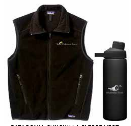
PATAGONIA SYNCHILLA FLEECE VEST PLUS INSULATED CAMELBAK WATER BOTTLE