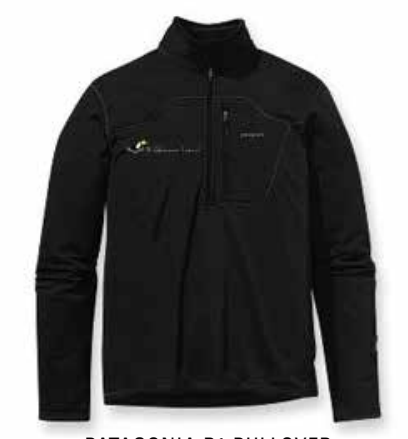
PATAGONIA R1 PULLOVER