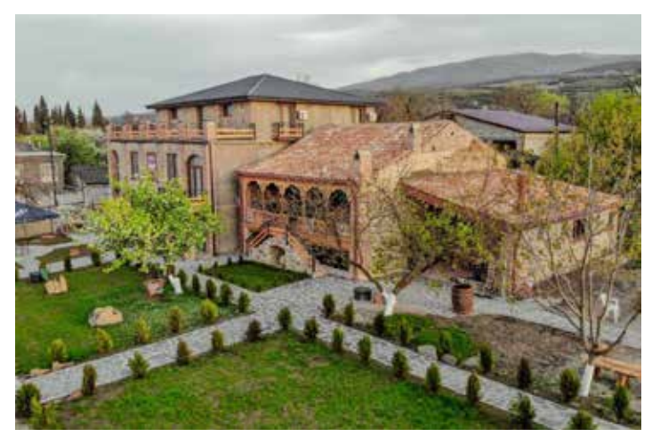
CHATEAU IKALTO Ikalto, Georgia Day 8 (1 night)

Located in beautiful stone buildings near a vineyard, Chateau Ikalto is a wonderful welcome to the region. Guest rooms are comfortable with nice views and the hotel has a restaurant, outdoor swimming pool, bar, and lounge area, perfect for relaxing after a day's explorations.