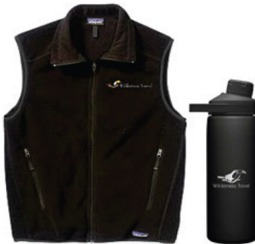
PATAGONIA SYNCHILLA FLEECE VEST + KLEEN KANTEEN 27OZ WATER BOTTLE