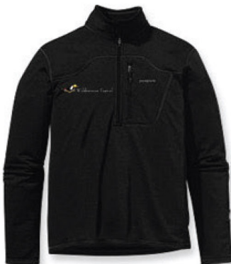
PATAGONIA R1 PULLOVER

We are very proud to have one of the highest rates of repeat travelers in the business, and have established the Wilderness Travel Toucan Club to reward you for your loyalty. For more information, please visit the Toucan Club page of our website at www.wildernesstravel.com/toucan .