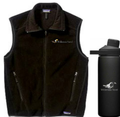
PATAGONIA SYNCHILLA FLEECE VEST PLUS INSULATED CAMELBAK WATER BOTTLE