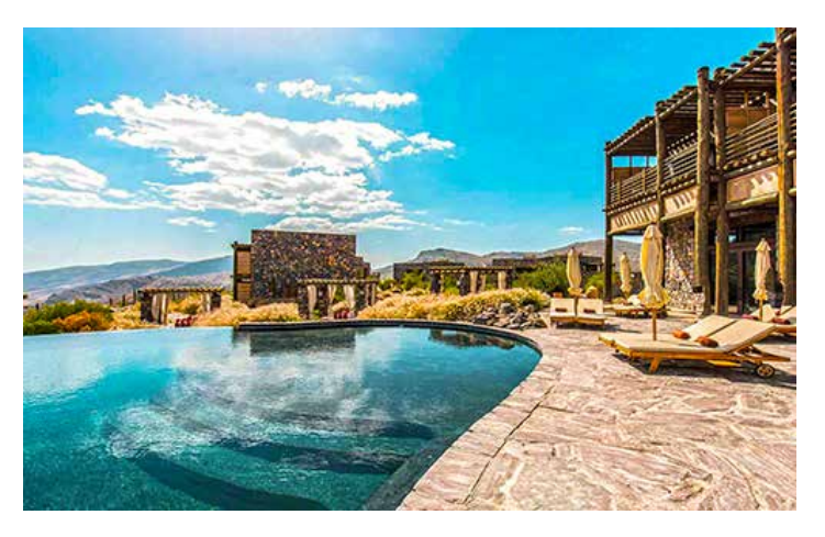
ALILA JABAL AKHDAR