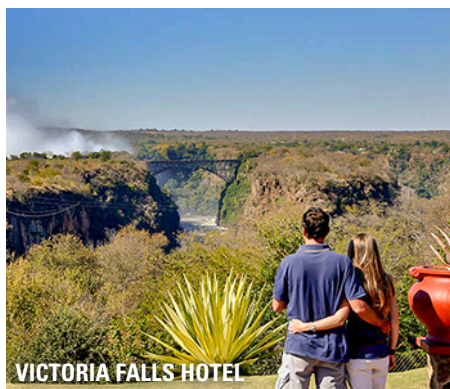
VICTORIA FALLS HOTEL