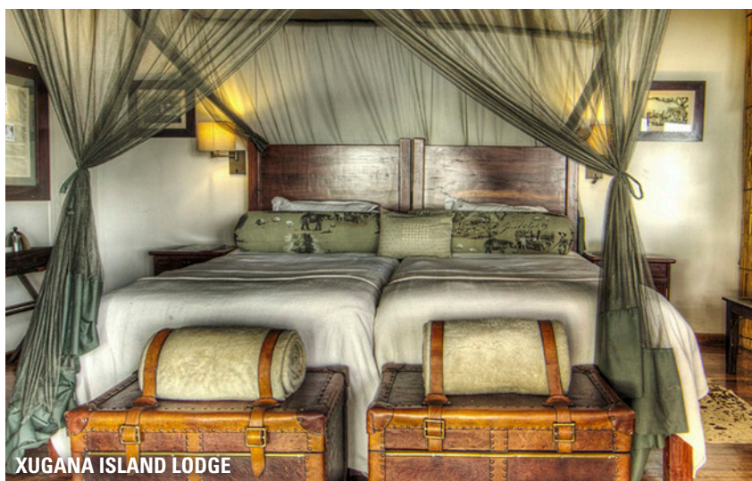
XUGANA ISLAND LODGE