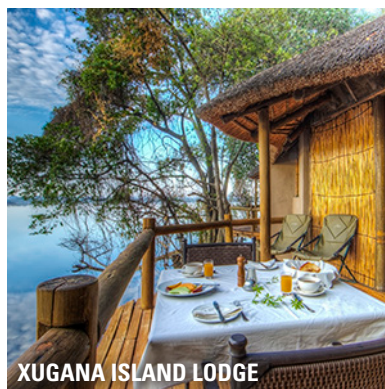
XUGANA ISLAND LODGE