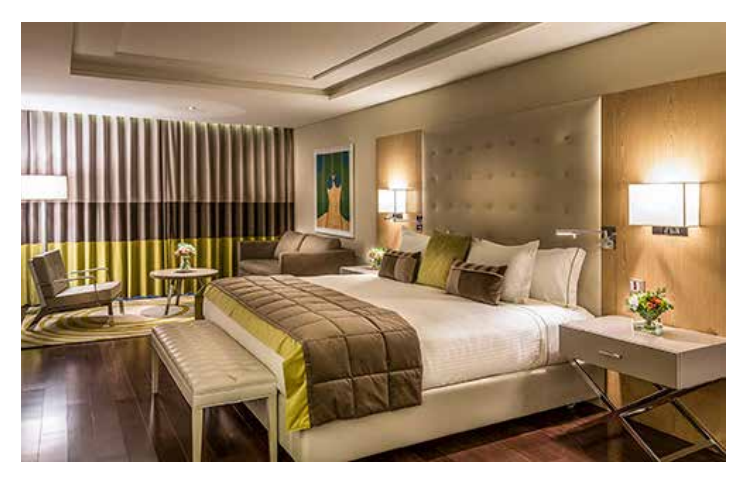
PALLADIO HOTEL Buenos Aires, Argentina