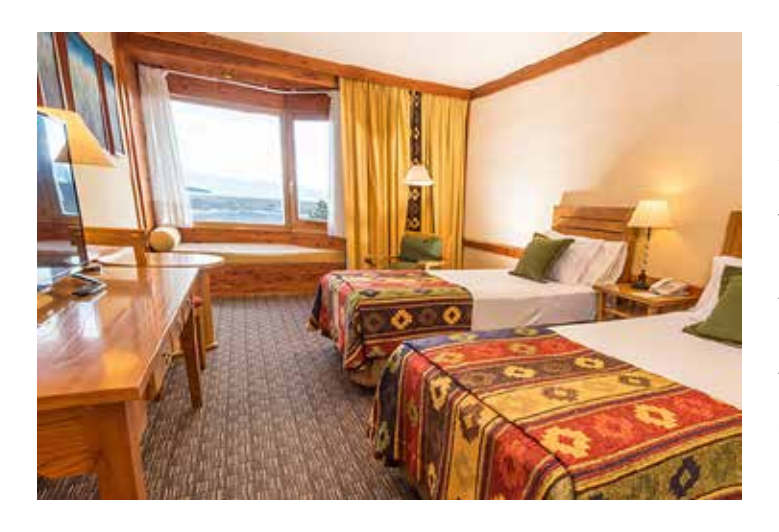
MIRADOR DEL LAGO HOTEL

El Calafate, Argentina Day 7 (1 night) Day 10 (1 night)