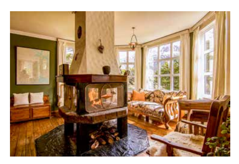
HOSTERÍA EL PILAR

Located in the heart of the Recoleta neighborhood with its indie boutiques, hip enclaves, and architectural charm, the Palladio Hotel features modern guest rooms, an outdoor heated pool, and a spa and fitness center. The restaurant serves continental breakfast along with Mediterranean cuisine, and the Negresco Bar is a fun place to try an innovative cocktail while locals stroll in for after-work drinks.