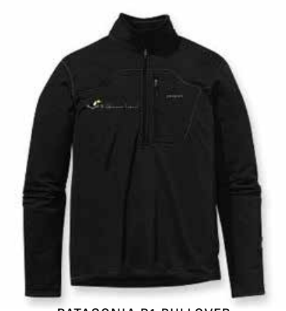
PATAGONIA R1 PULLOVER