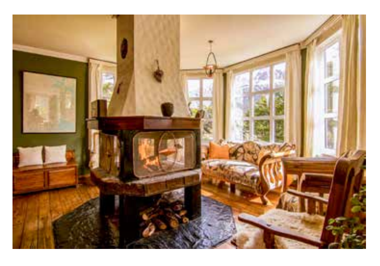
HOSTERÍA EL PILAR

Set in the Palermo neighborhood of Buenos Aires where you can walk to art galleries, shops, bars, and a wide range of restaurants, the CasaSur Bellini features spacious, studio-like guest rooms with stylish, modern decor. There is also a spa, fitness center, and an outdoor swimming pool. At breakfast, try the medialunas con dulce de leche—a special Argentine pastry treat.