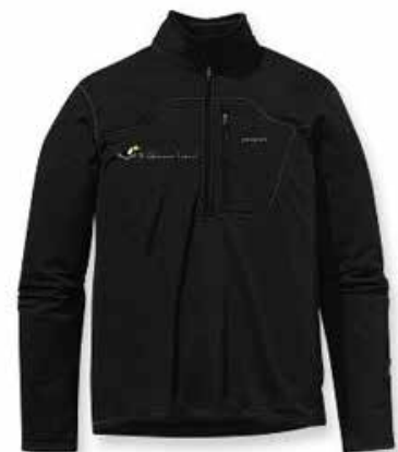
PATAGONIA R1 PULLOVER