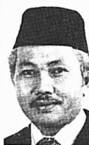
DATUK TAIB ... rebels dissatisfied with his style of government.