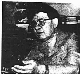
Datuk Stephen Kalong Ningkan

Chinese, a Bidayuh and an Iban elected representatives reflecting a multi-racial composition, we are not strong," he said.