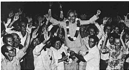
Datuk Patinggi Haji Abdul Taib won the Sebandi by-election unopposed.

Datuk Abdul Rahman's involvement in politics began soon after he returned from his law studies in the United Kingdom in the late 50s. He gained his political prominence when he was appointed Chairman of the Sarawak Alliance Election Committee in 1964. Though he was defeated in the Kuching Municipal Council Election in 1963, he was selected as the State nominated member in the Parliament by Datuk Stephen Kalon Ningkan, the First Chief Minister of Sarawak. Datuk Abdul Rahman was appointed as Assistant Minister of Rural Development in the Federal Government. Two years later he was made a Full Minister holding the portfolio of Lands and Mines and in 1969 he became the Minister of Education in Tun Razak's National Operation Council after the May 13 incident.