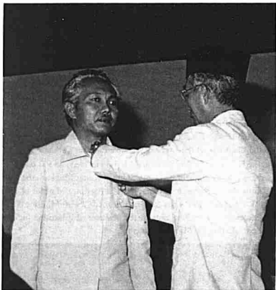
Datuk Patinggi Tan Sri Haji Abdul Rahman Yakub pinning the brooch on Datuk Patinggi Haji Abdul Taib, signifying the transfer of leadership.