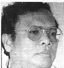
ENCIK ADENAN SATEM