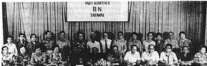
□ The 26 State Assemblymen who are opposing Chief Minister Datuk Patinggi Taib Mahmud. Two more are in Kuching