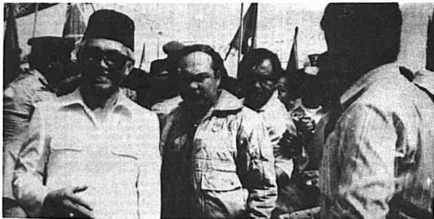
THE Chief Minister in Kota Samarahan yesterday

The Chief Minister said BN with a strong and committed teamwork, was expected to achieve the "36 seats" as predicted.