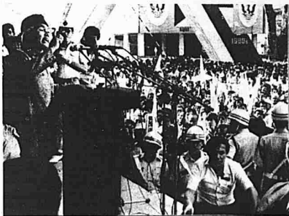
● Datuk Taib addressing the rally at Central Padang yesterday. (More pixs on Page 2).

"They say the assembly should not be dissolved because they already have a majority but I know they are actually scared to go before the people," he said.