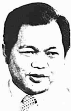
DATUK LEO MOGGIE ... Reconsolidating political factions.

"We will endorse the appointment of Tun Rahman as the new Chief Minister if he and the others in the Bersatu group were to win