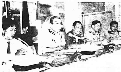
THE Commissioner of Police (2nd from left) with his senior officers at the press conference.

five by-elections. We have gone through all these, some more challenging than others, without any serious upward or unpleasant incidents," he said.