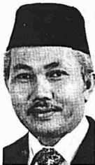
DATUK TAIB ... ordered that 25 timber concessions be revoked.

The Chief Minister was also told there was an unusual amount of transferring of timber concessions