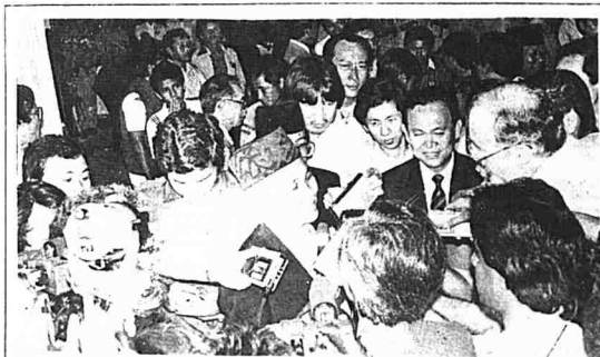
VICTORIOUS . . . A happy Datuk Patinggi Haji Abdul Taib Mahmud speaking to newsmen and TV crew shortly after the Barisan Nasional was returned to power at Rumah Sarawak early yesterday. The state BN secured 28 of the 48 seats it contested and garnered 249,249 or about 55 percent of the 453,749 votes cast in the just concluded state general elections.

Tun Abdul Rahman had also served as Sarawak Chief Minister for 11 years, beginning in 1970.