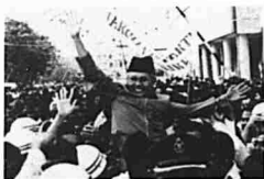
Cover photo: Datuk Patinggi Haji Abdul Taib Mahmud being chaired by supporters at Central Padang.

Introduction Copyright © 1987 by Summer Times Publishing, #15-06 Tan Boon Liat Building, 315, Outram Road, Singapore 0316. All rights reserved. No part of this publication may be reproduced or transmitted in any form or by any means, electrical or mechanical, including photocopy, recording, or any information storage or retrieved system, without permission in writing from the publisher. Printed in Singapore.