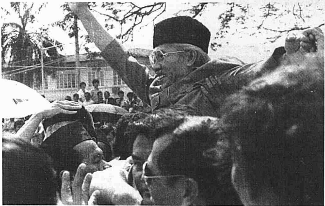
Datuk Patinggi Taib being chaired by supporters.