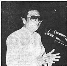
ENCIK ADENAN SATEM