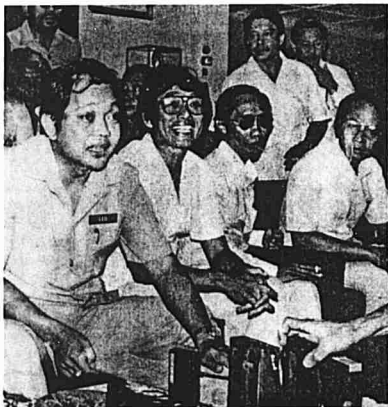
July 27 ... Datuk Leo Moggie quits SNAP to head PBDS. Here he announces the new party protem committee.