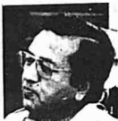
Datuk Seri Dr Mahathir Mohamad

ALL four component parties in the Sarawak Barisan Nasional will be using the BN's 'dancing' symbol in the coming state elections, the coalition's Supreme Council decided today, throwing rebel Parti Bansa Dayak Sarawak into a quandary over their "fate" from this point onward.