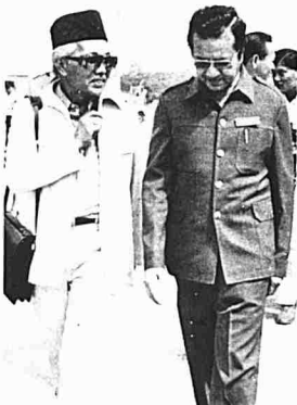
Dr Mahathir with Datuk Patinggi Taib on his arrival in Matu yesterday to campaign for the Barisan Nasional

Tun Abdul Rahman was not at Mato-Daro to meet Dr Mahathir. Dr Mahathir's speech was broadcast live on Radio Sarawak.