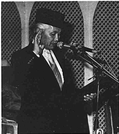
Datuk Patinggi Haji Abdul Taib Mahmud was sworn in at 2.30 am, 17th April to form the next State Government for another term of five years.