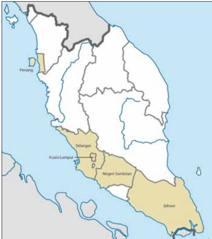
Map 1 | States in Peninsular Malaysia and Federal Territory where Interviews were Conducted

Finally, two countries of origin — Indonesia and Nepal — were chosen as sites to conduct interviews with returned migrant workers. Malaysia is a major destination for migrant workers from both Indonesia and Nepal, and thus it was reasoned that returned migrant workers would not be difficult to locate. Local experts were retained to identify migrant workers for interviews, and to conduct and translate the interviews. In Indonesia, the local researcher travelled to isolated villages in West Java known to have large numbers of migrant workers who had returned from Malaysia. In Nepal, the researcher interviewed migrants in Kathmandu, Nuwakot, and Nawalparasi.