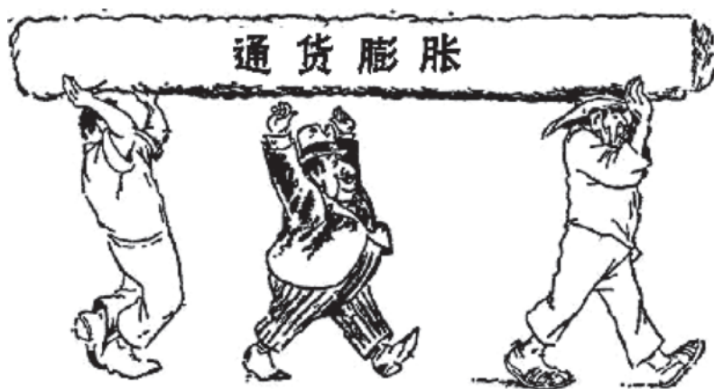
"Inflation" (cartoon from Mexico)