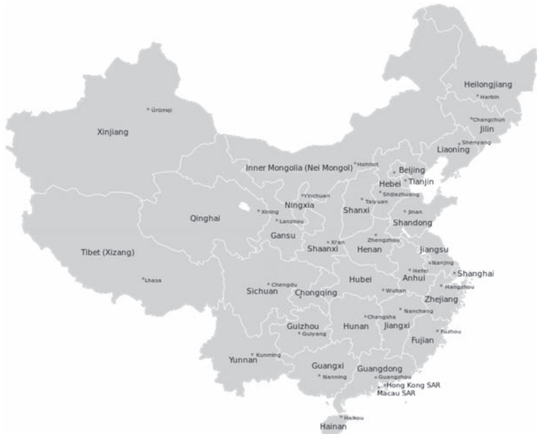
Map 1: People's Republic of China