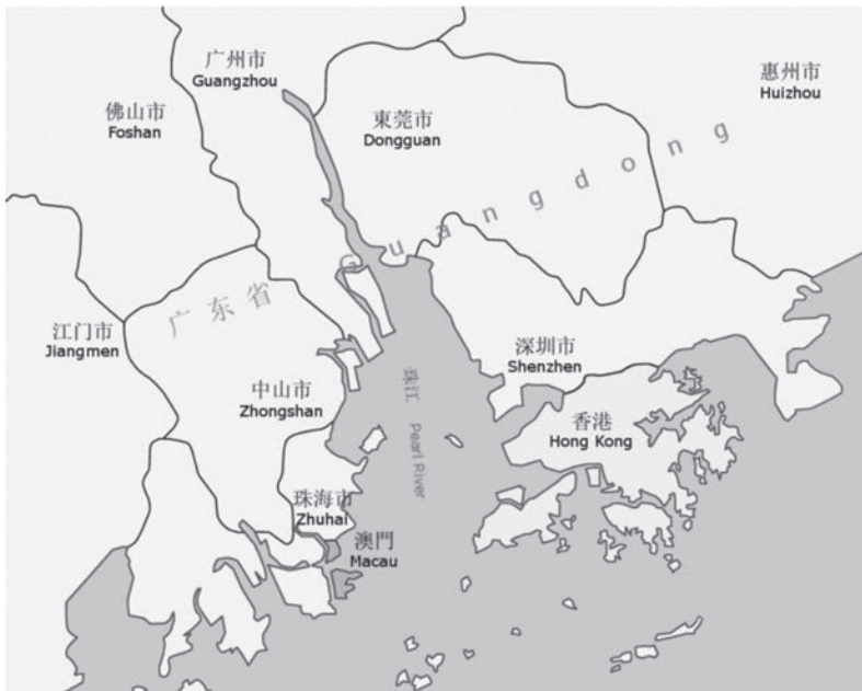
Map 2: The Pearl River Delta

in a factory. She made contact with a number of Marxist-oriented university students who had also gone to work in factories, some for idealistic reasons, others simply because they needed the wages. This informally constituted network of activists began conducting interviews with workers in their spare time, with the specific aim of trying to establish a more systematic understanding of the causes, processes, and outcomes of strikes. In carefully considering the role of various types of actors—workers, managers, the union, NGOs, lawyers, and the state—these activists were also interested in compiling relevant practical knowledge that was then disseminated in industrial zones as a series of magazines. Without this network of people embedded in factories, it would have never been possible to get such detailed information. Strikes are still considered quite politically sensitive in China, and so it is almost always necessary to establish a high level of trust before people will openly discuss their experiences.