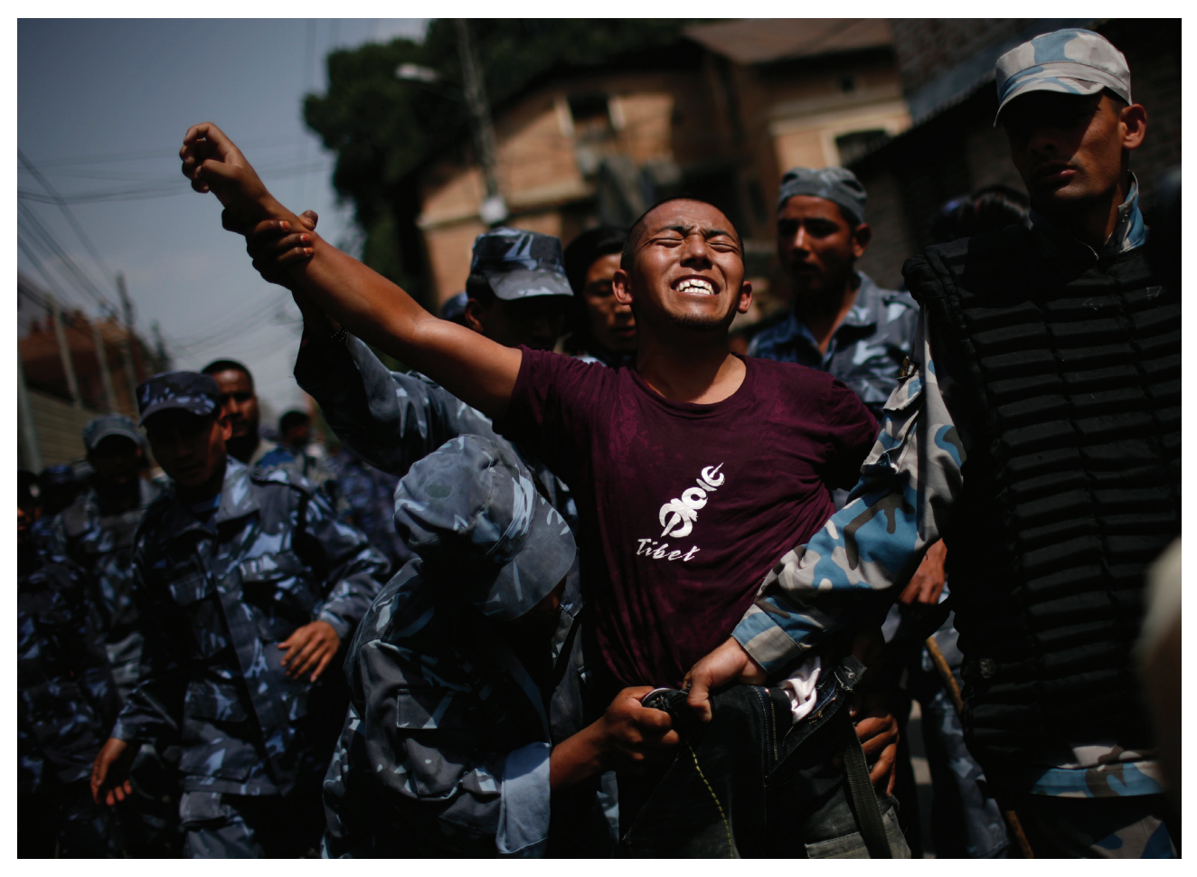
Kathmandu, Nepal - March 30: A pro-Tibetan demonstrator screams 'Free Tibet' while being forcibly detained by Nepali police during a pro-Tibetan protest outside of the Chinese consulate March 30, 2008 in Kathmandu, Nepal.

of November 2020, Saudi Arabia was detaining two Chinese Uighurs and considering their forced return to China.<sup>81</sup>