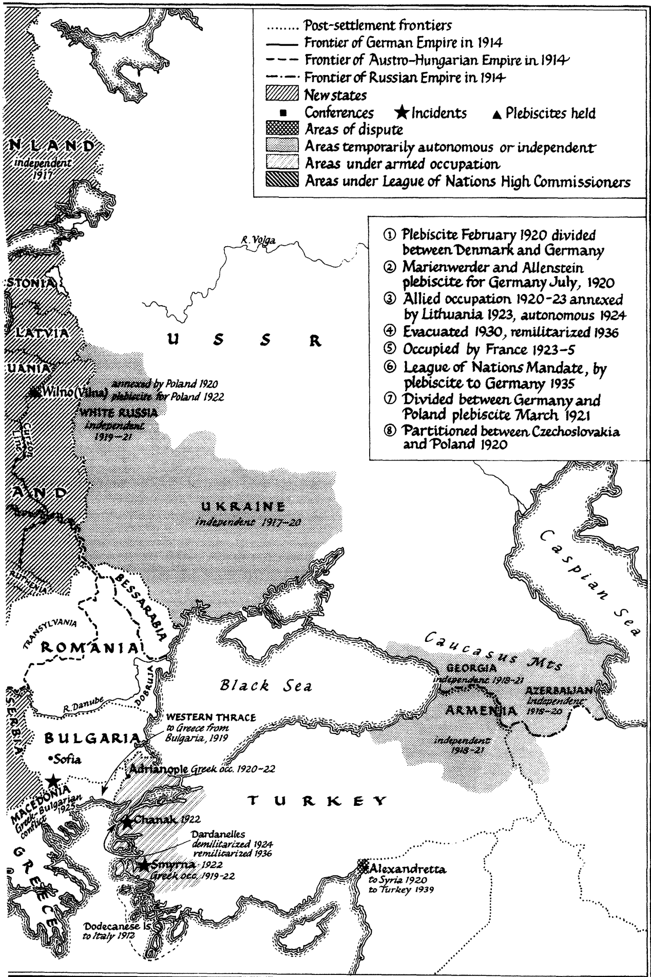
I National conflicts and frontier disputes, 1919-1934.