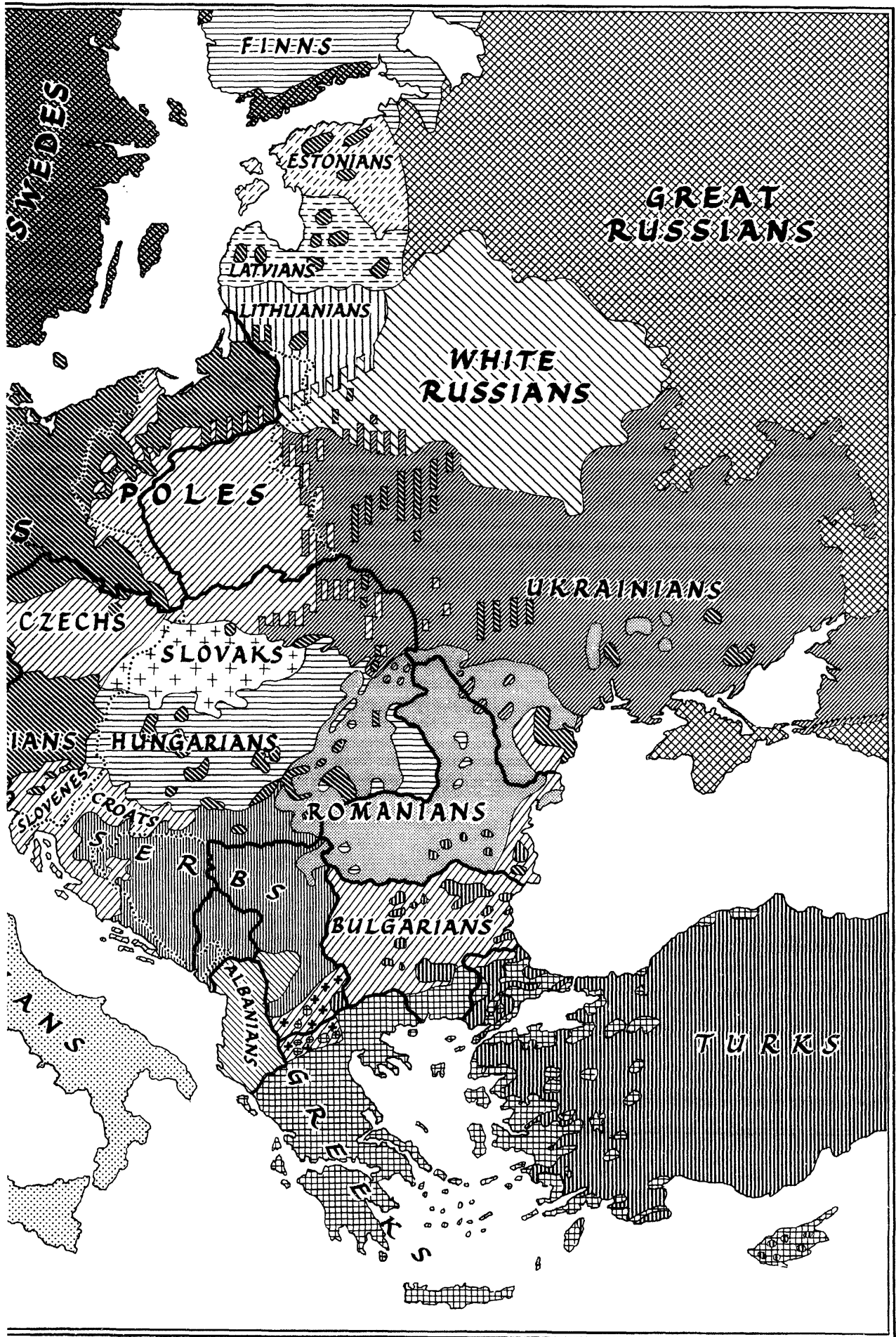
2 Peoples, languages and political divisions in the nineteenth century: the East European linguistic jigsaw.