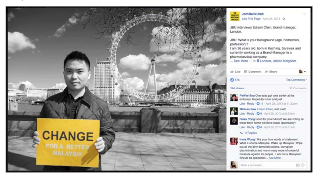
Figure 3. Image from Jom Balik Undi Campaign