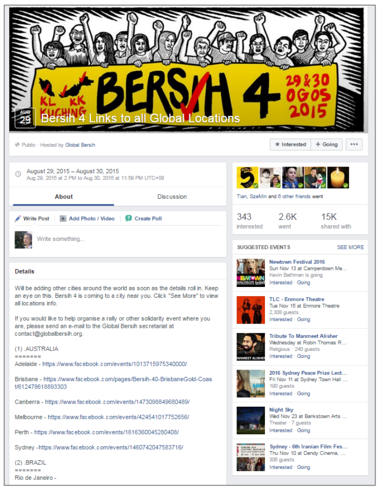
Figure 1. List of Bersih-related Facebook Groups on the Global Bersih Facebook Page

Beyond enabling community members to act as influencers, social media also allowed them to share and replicate informational resources . Through their main Facebook page, the Global Bersih group shared instructions on how to organize rallies overseas. These instructions resonated with overseas supporters who had expressed interest in becoming more involved in the movement due to their inability to physically attend the Bersih rallies in Malaysia. The Global Bersih secretariat explained: