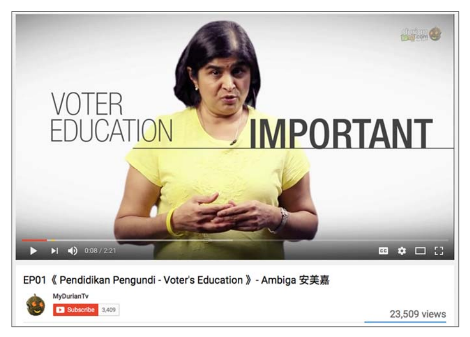
Figure 2. Excerpt of Voters Rights Education Video

The aim of JBU was multi-pronged: bring attention to the overseas voter disenfranchisement, empower Malaysians to make positive actions to make a difference...[and] not just whine on social media, [and] encourage the Malaysians living in Malaysia to take the elections seriously. Despite the substantial numbers of people feeling disgruntled, many were not registered voters or felt their vote didn't matter. We are all Malaysians. We can do something simple that would make a difference.