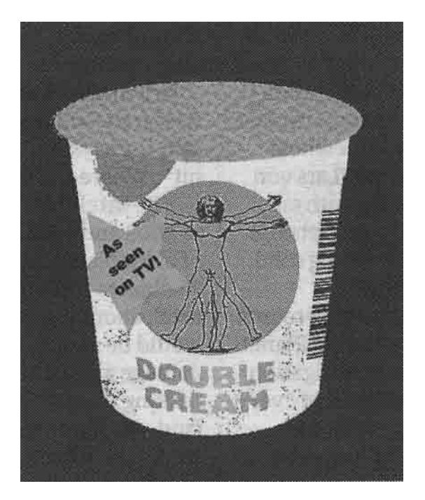
Figure 2.1 Vitruvian Man on Starbucks Coffee Cup

The global economy is post-anthropocentric in that it ultimately unifies all species under the imperative of the market and its excesses threaten the sustainability of our planet as a whole. A negative sort of cosmopolitan interconnection is therefore established through a pan-human bond of vulnerability. The size of recent scholarship on the environmental