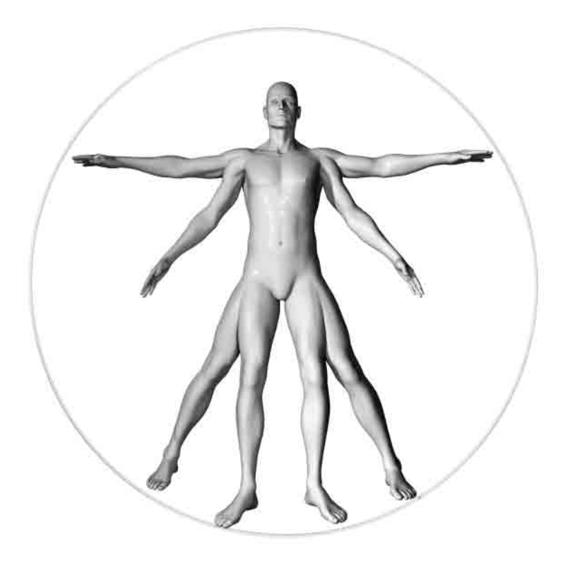
Figure 2.4 Victor Habbick (Maninblack), Robot in the style of Leonardo's Vitruvian Man

others, while avoiding the contempt for the flesh and the trans-humanist fantasy of escape from the finite materiality of the enfleshed self. As we shall see in the next chapter, the issue of death and mortality will be raised by necessity.