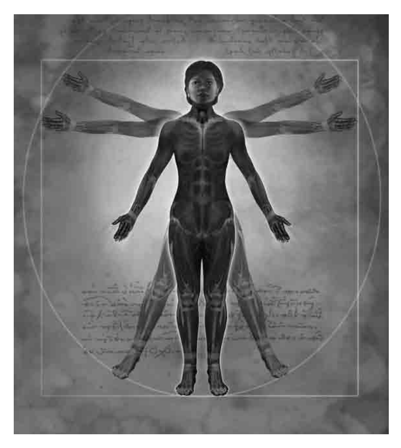
Figure 1.2 New Vitruvian Woman

feminism builds on the Humanist principle that 'Woman is the measure of all things female' (see figure 1.2) and that to account for herself, the feminist philosopher needs to take into account the situation of all women. This creates on the theoretical level a productive synthesis of self and others. Politically, the Vitruvian female forged a bond of solidarity between one and the many, which in the hands of the second feminist wave in the 1960s was to grow into the principle of political sisterhood. This posits a common grounding among women, taking being-women-in-the-world as the starting