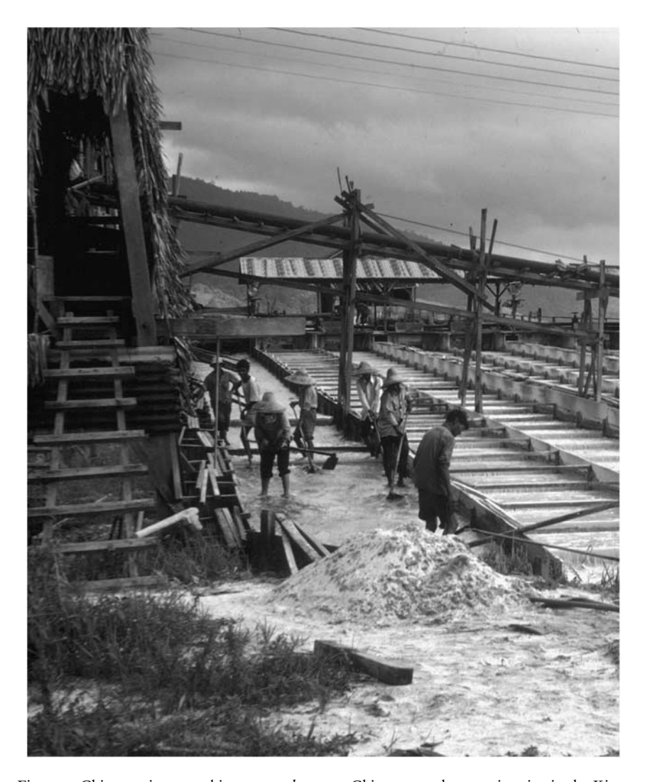
Figure 4. Chinese miners working on a palong at a Chinese gravel pump tin mine in the Kinta Valley (Malaysia), 1978.

workers by mine owners reduced. The power of the Kapitan China (the Chinese community head) also weakened, and the position was abolished in 1902. Furthermore, following the abolition of the indenture contract system for Indian labour in 1910 the system was also officially abolished for Chinese labour recruitment in 1914.