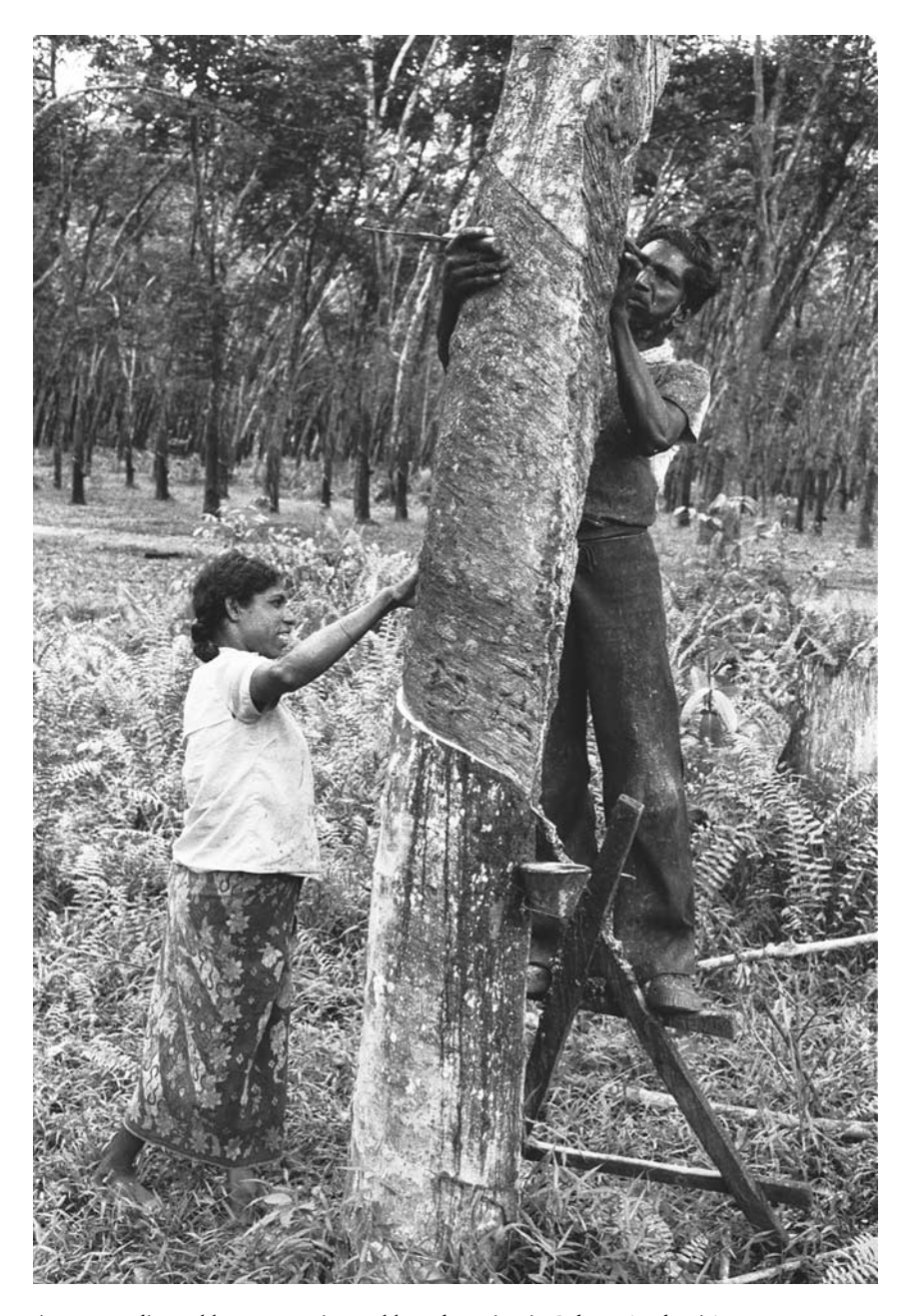
Figure 3. Indian rubber tappers in a rubber plantation in Pahang (Malaysia), 1978. Photograph: Ian Metcalfe .