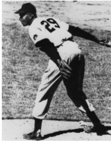
Figure 3. Satchel Paige helped erase problems in baseball, but nobody’s gaining in the race race. See www.satchelpaige.com/index.html

If intentional racism can find no support in the biological data, it can be just as misleading and even pernicious to assume that none of the known genetic variation is important. Why else is it that those who make