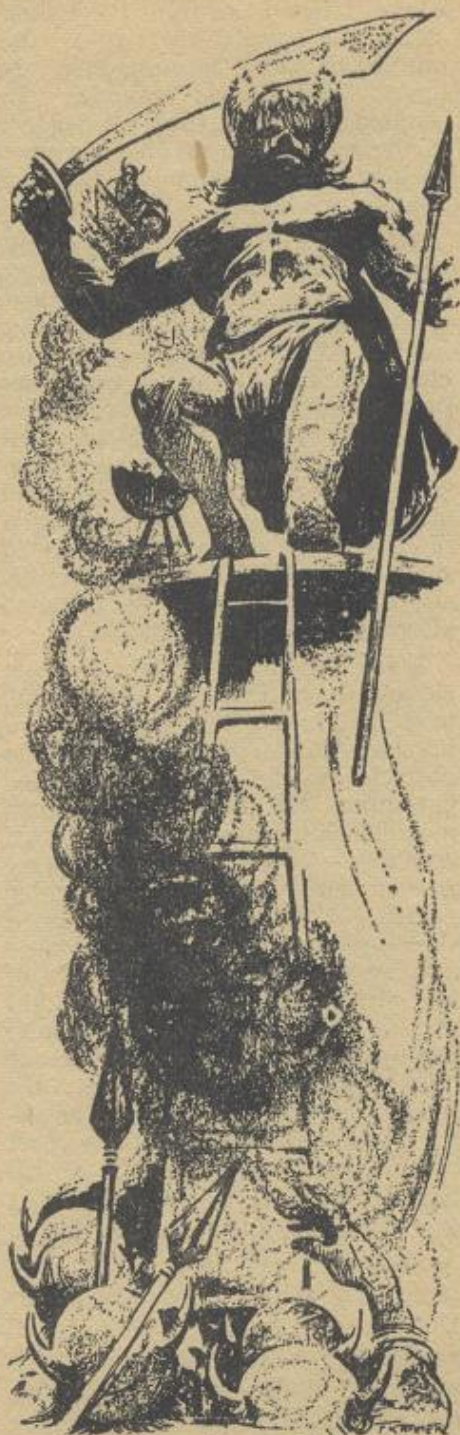
Wan Tengri's sword flashed out to halve the flying javelin.