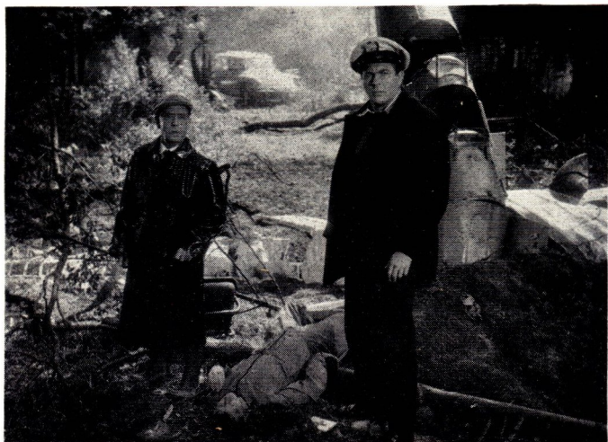
Professor Coker (MERVYN JOHNS) and Bill Masen (HOWARD KEEL) find a crashed aircraft surrounded by Triffids