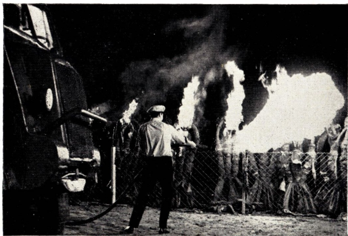
Bill Masen (HOWARD KEEL) tries flame- throwing tactics to defeat the Triffids