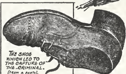
THE SHOE WHICH LED TO THE CAPTURE OF THE CRIMINAL. (FROM A PHOTO).