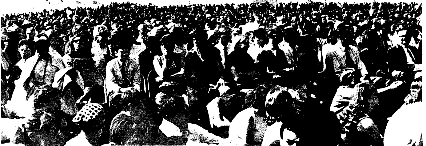
The March on Washington--April 17, 1965.