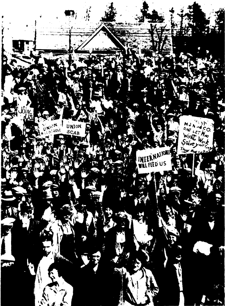
Strikers at Gastonia, N.C., 1929