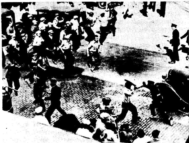
Minneapolis General Strike Battle, 1934