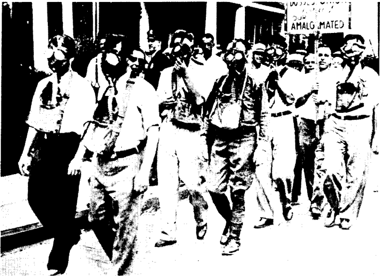
Clothing Workers Prepare for Battle