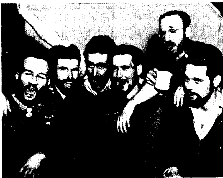
Victorious Sit-Down Strikers, 1937