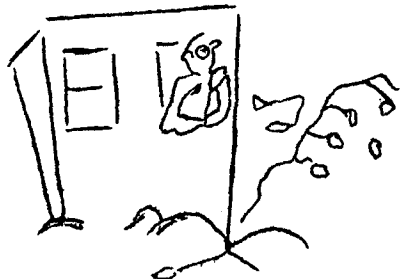
This is the person who writes for peace

As you of course realize, there is no time when candidates for public office are so sensitive to public opinion as they are in the weeks just preceding a national election. The accompanying blue sheet makes simple, practical suggestions; by following them you share in a nation-wide movement which has accomplished much already toward registering the popular demand for peace on the minds of the political leaders. This impression will be greatly strengthened if, during the last days of the campaign, each candidate receives a large number of such communications. IF YOU WANT PEACE, SAY SO! NOW!!!