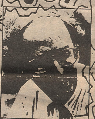
Colman McCarthy Founder and Director

"The first class each semester, I give my students a quiz. I list some people like U.S. Grant, Robert E. Lee, Caesar, Napoleon. Students easily identify them as generals. Then I list some peacemakers: Dorothy Day, Jeannette Rankin, A.J. Muste, Sojourner Truth, Thomas Merton. These draw blanks. In too many schools, the peace message is ignored. We just process our kids as though they're cheese getting a degree at Velveeta U. I'm working to change that. I'm ever-heard by the large numbers of students and teachers eager to join in. In the 1990s, this is where the peace movement ought to be. We have 3,000 colleges and universities, 27,000 high schools and 78,000 grade schools. Each should have a program in peace studies and conflict resolution and teach the skills of nonviolence with the same diligence that math, science and languages are taught. Otherwise, how else do we break the cycle of violence?"