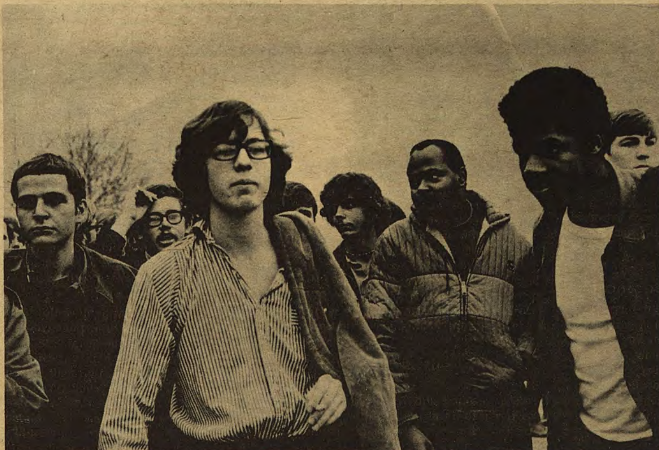
Holy Cross students kick scab GE recruiter off campus