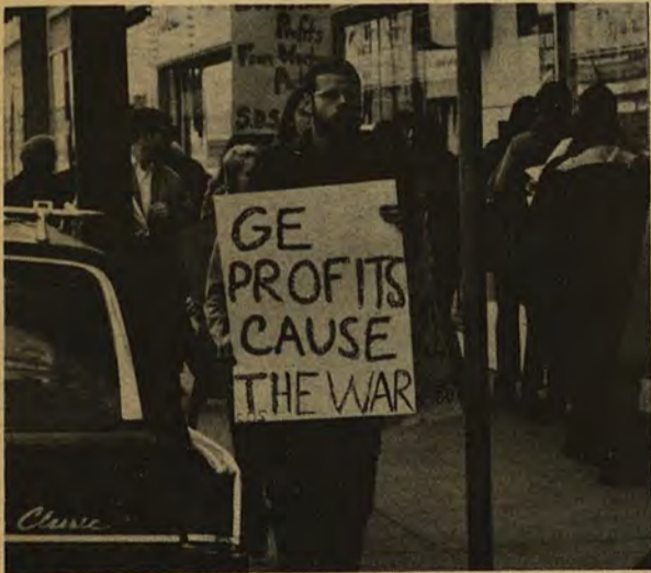
Chicago students boycott Hotpoint

The bosses claim that inflation is caused by high wages. This is a lie. Prices are high because corporations, in competition with each other, have to keep those profits rolling in. The truth is that GE's profits have been increasing at a record rate. Their need to maximize profits and to keep up immense war spending to protect the source of those profits is what causes inflation.